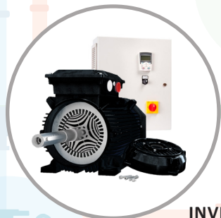
INVENTA TEK UE CONTROL PANEL