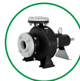
BSN 2 & 4 POLES