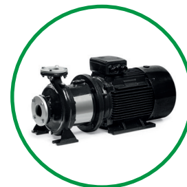
CNG 2 & 4 POLES