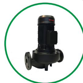
ILP 2 POLES